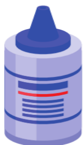
The gel that will be applied to your tummy