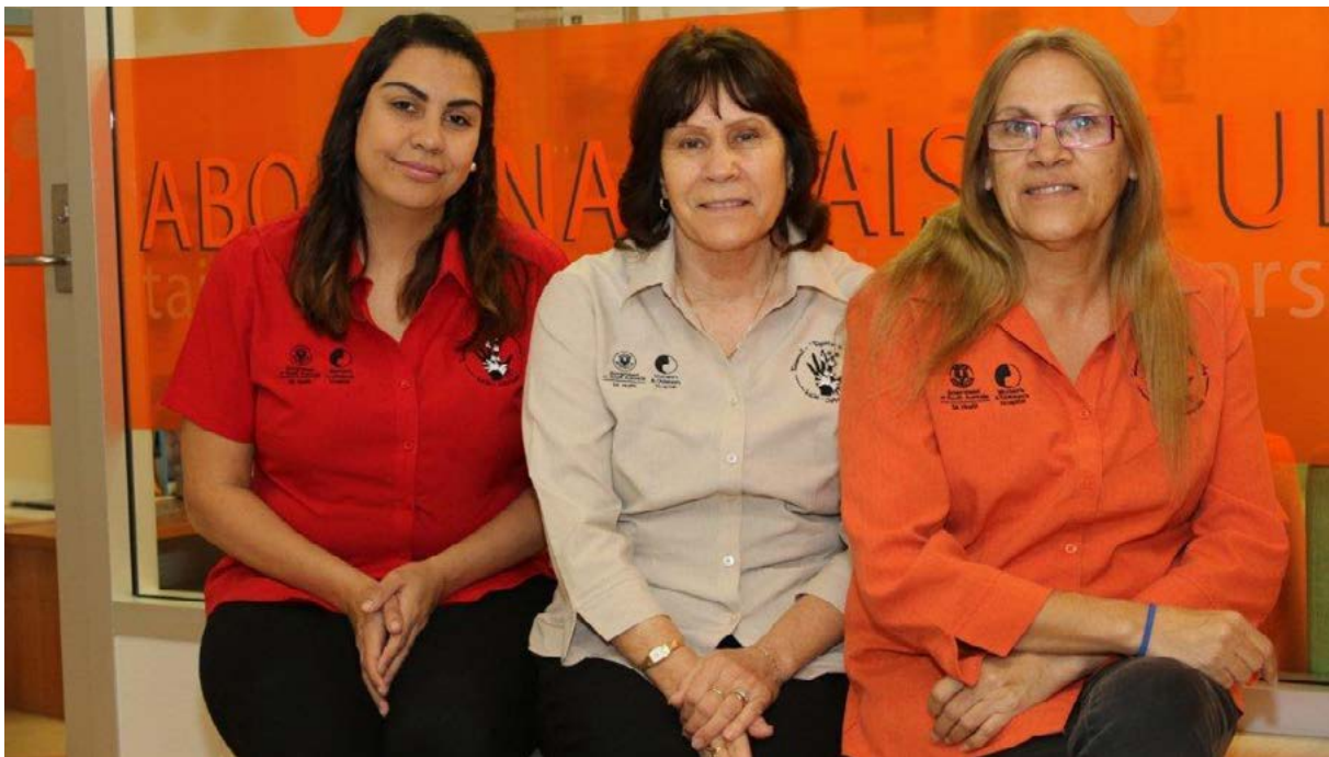
Aboriginal Liaison Unit Staff

If you would like to receive updates on the development of the new WCHN Aboriginal Health Plan and/or be involved in future consultations, please contact the WCHN Aboriginal Health Division on 8303 1674 or email newAHPfeedback@sa.gov.au